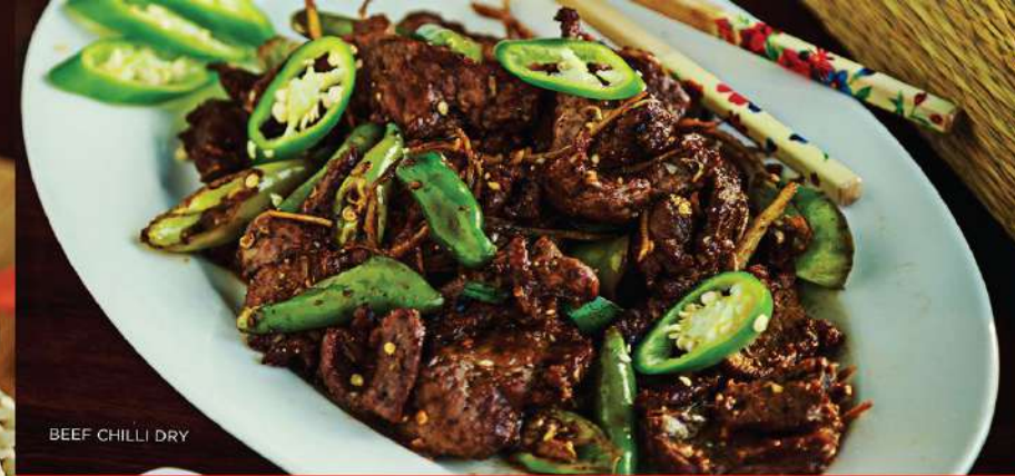
BEEF CHILLI DRY