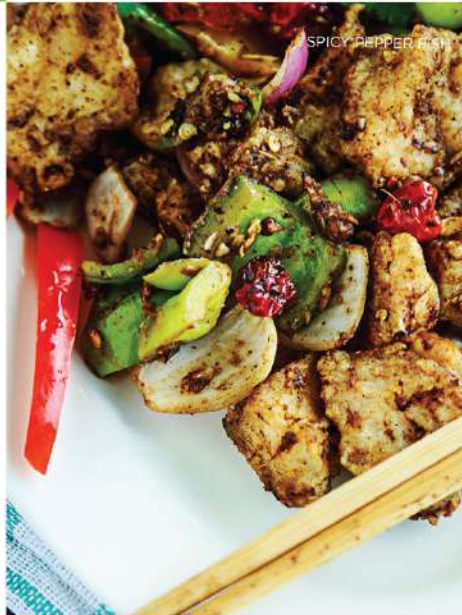
SPICY PEPPER FISH