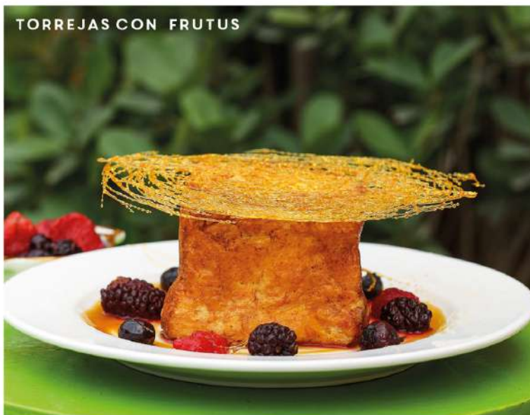
TORREJAS CON FRUTUS

An assortment of three different tacos; prawn, eggs divorciados, veggie & scrambled eggs 1899