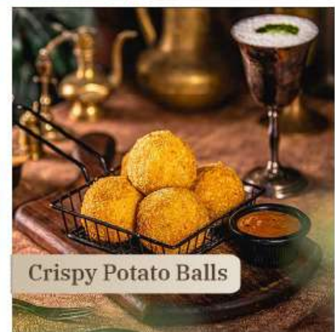
Crispy Potato Balls