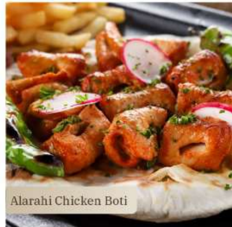
Alaraha Chicken Boti