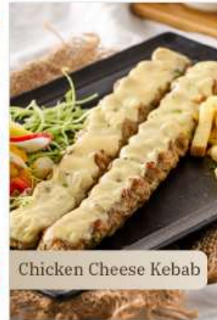
Chicken Cheese Kebab