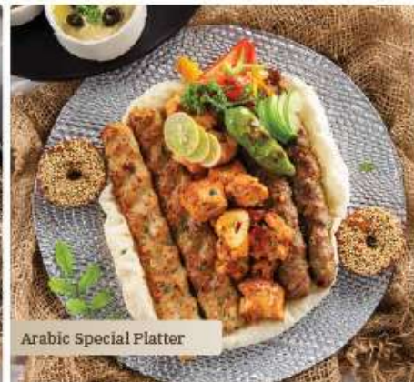
Arabic Special Platter