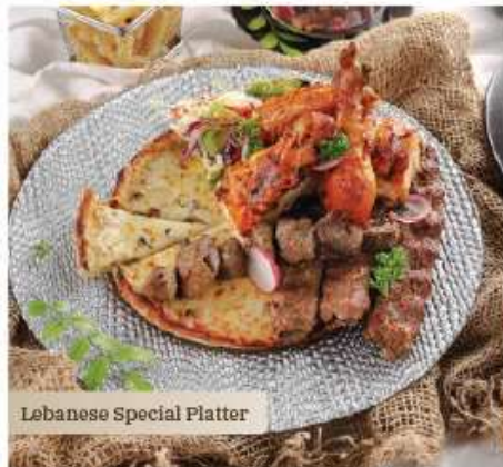
Lebanese Special Platter