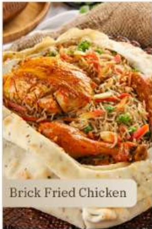
Brick Fried Chicken