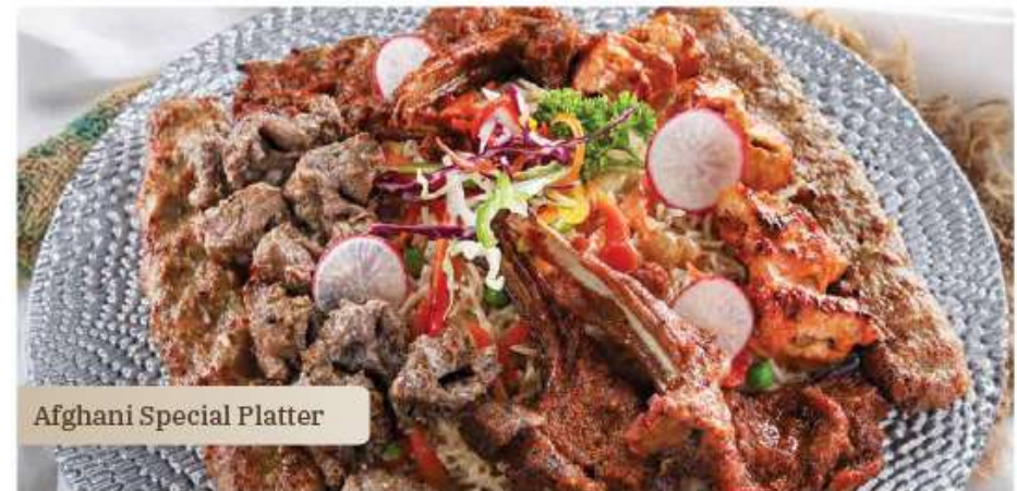
Afghani Special Platter