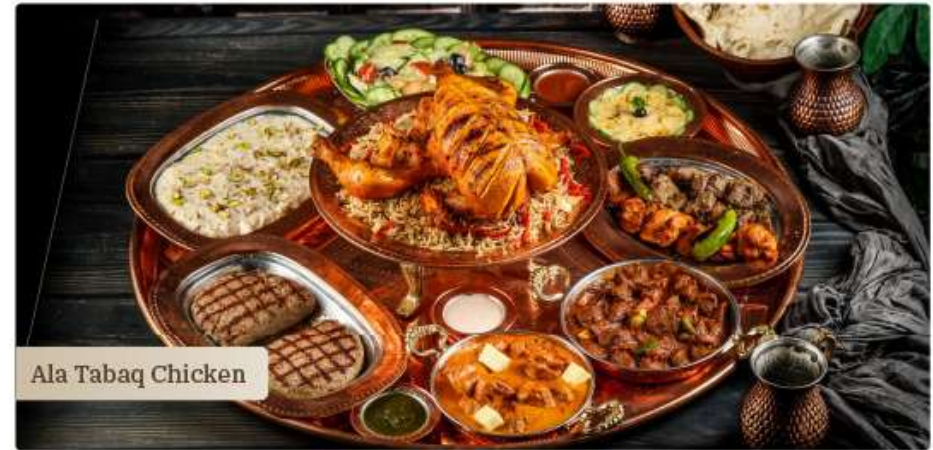
Ala Tabaq Chicken