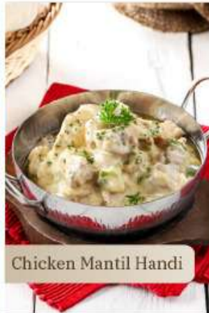
Chicken Mantil Handi