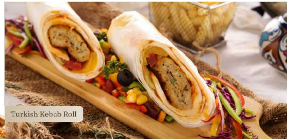
Turkish Kebab Roll