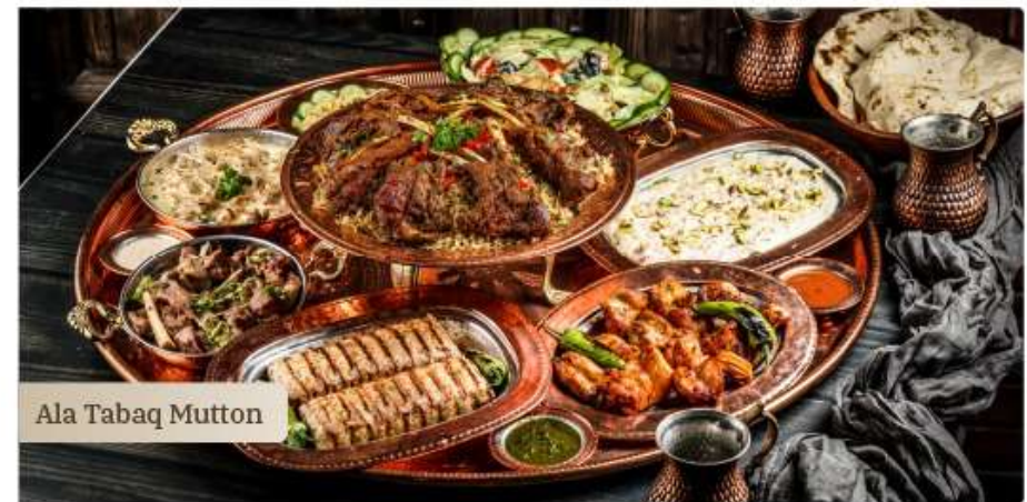
Ala Tabaq Mutton