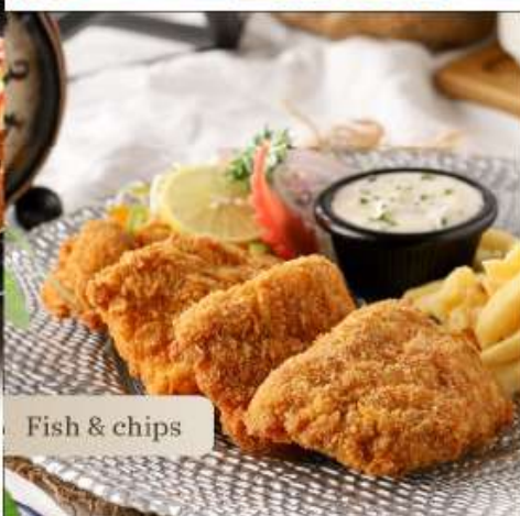
Fish & chips