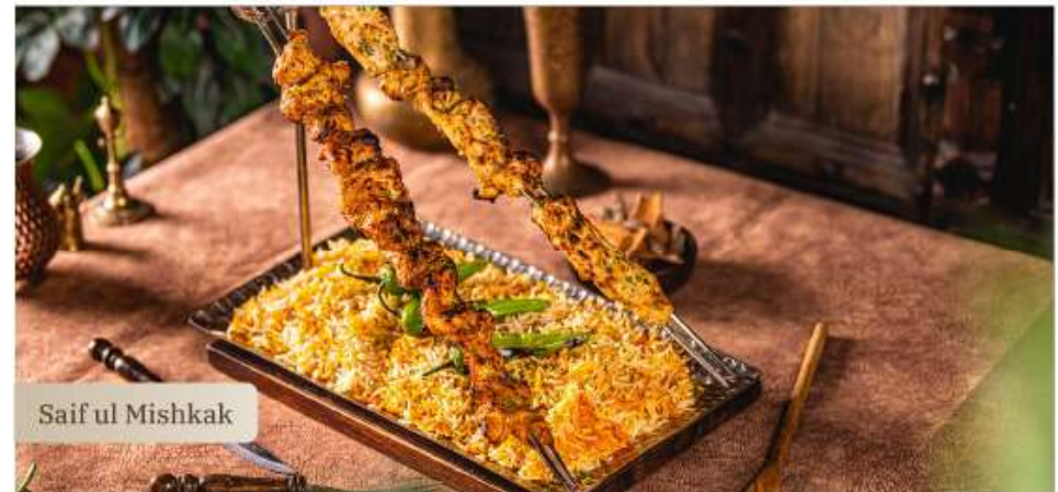
Saif ul Mishkak