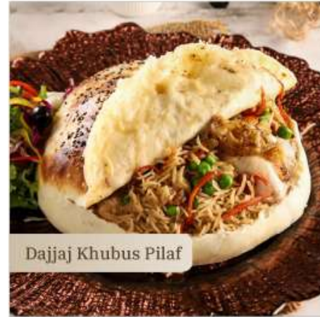
Dajjaj Khubus Pilaf